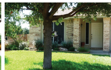
17517 Port Hood