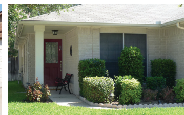
1260 Pine Portage Loop