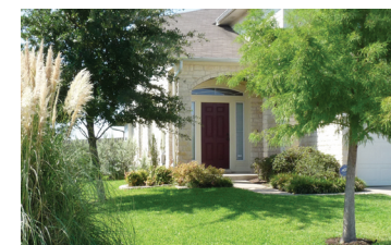
1419 Mojave Bend