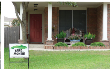
1404 Dillon Lake